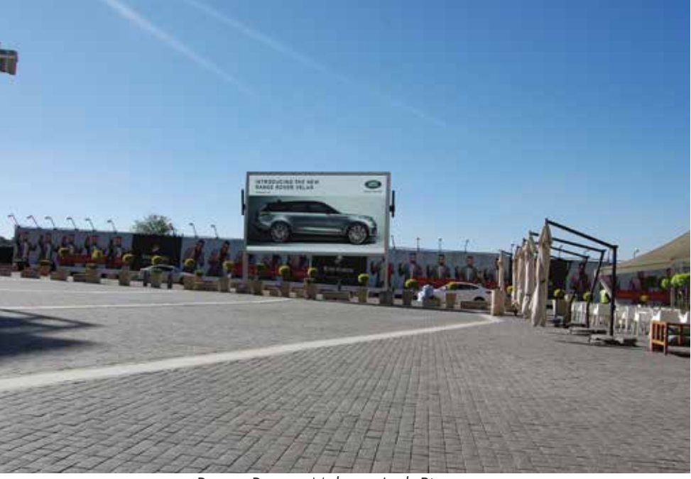
Range Rover - Melrose Arch Piazza

This DOOH strategy is already being rolled out by BOO! across South Africa's largest universities through BOO! Campus TV. The media platform is a first in South Africa and will be used primarily as a communication tool for the universities to talk to their students.