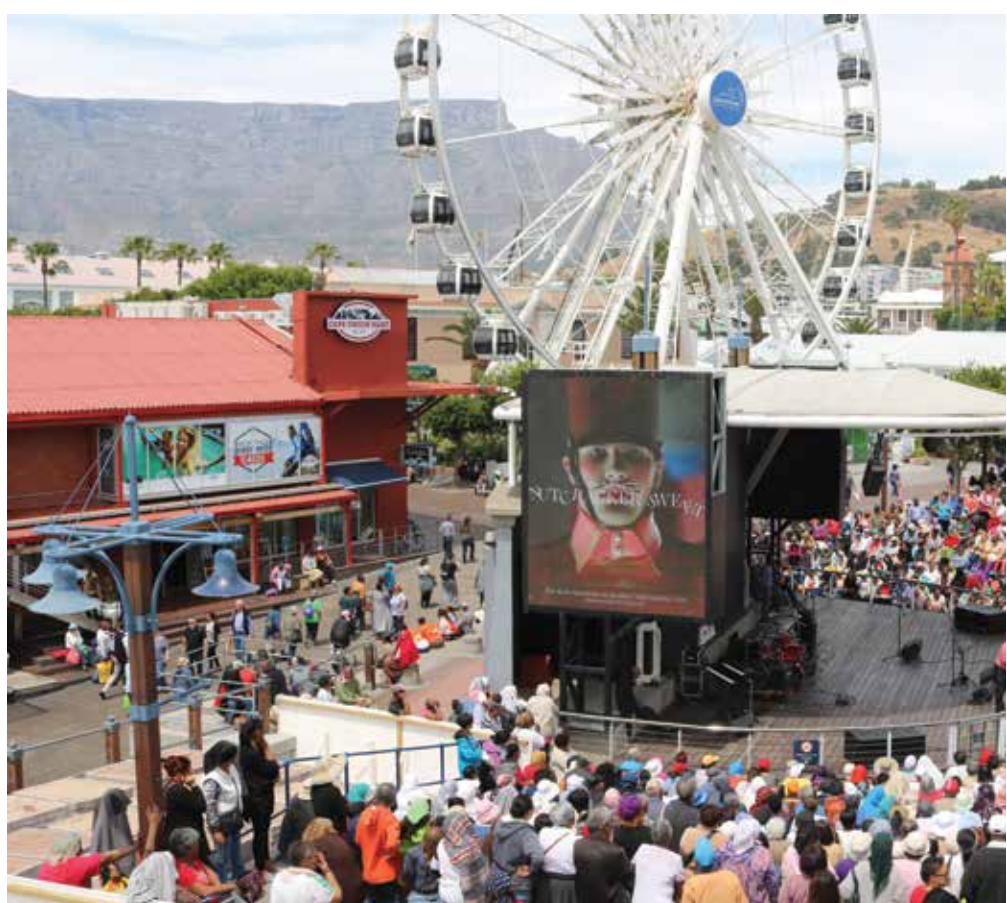
V&A Waterfront large format LED

shopping & retail SA // March 2019 Page 7