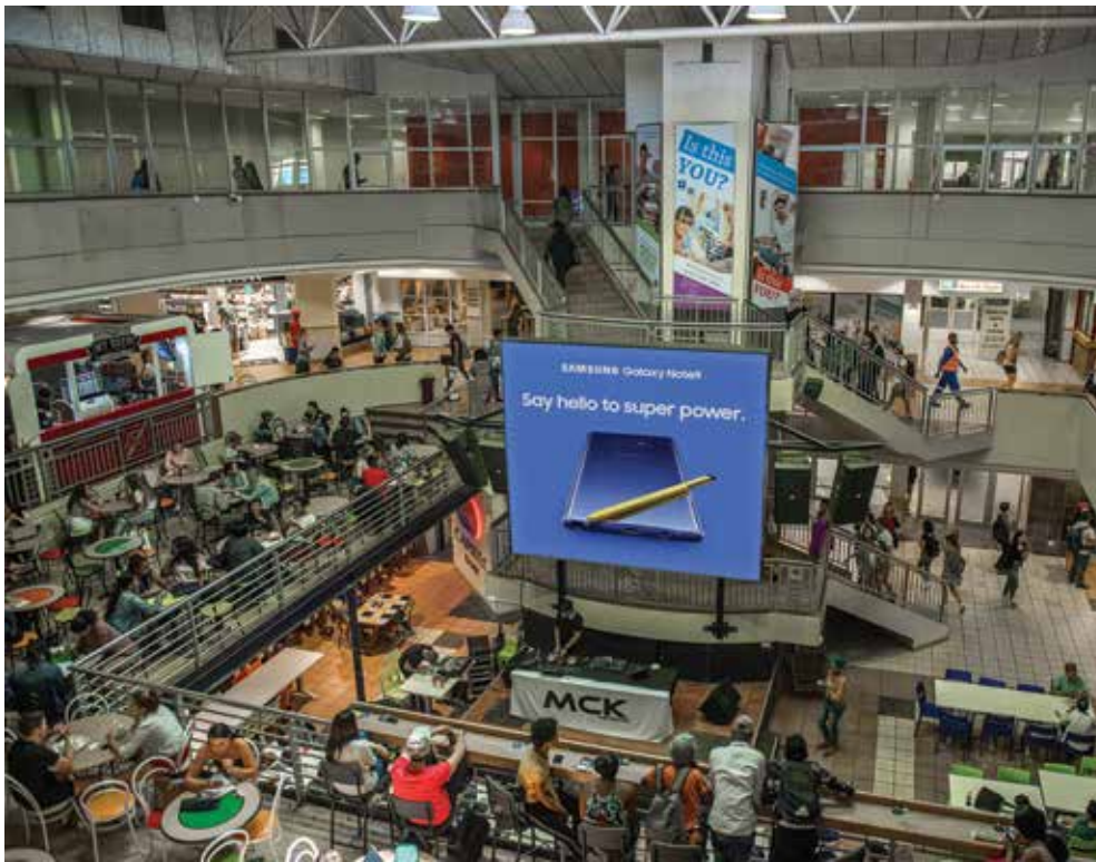
Die Neelsie - Stellenbosch University